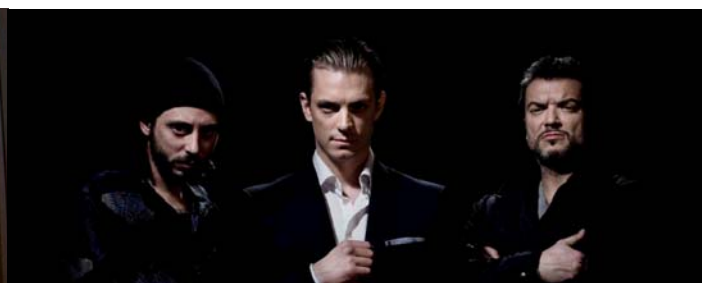
Easy Money