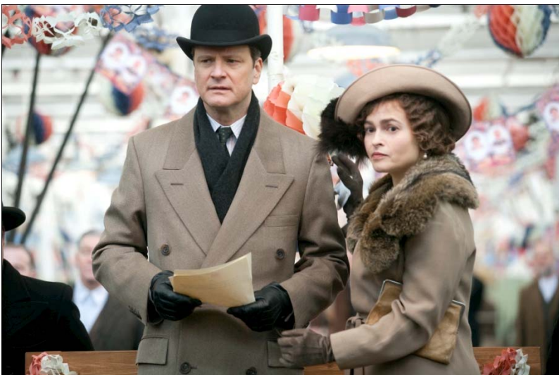
The King's Speech

The last two years have got off to flying starts for British films with Sundance, Berlin, BAFTA and Oscar® successes scored by films such as Danny Boyle's Slumdog Millionaire , James Marsh's Man on Wire , Armando Iannucci's In the Loop , Mohamed Al-Daradji's Son of Babylon and Lucy Walker's Waste Land . Cannes has seen British success with Andrea Arnold taking her second Jury Prize for Fish Tank and ovations for Mike Leigh with Another Year , Ken Loach with Looking for Eric and Route Irish , and Stephen Frears with Tamara Drewe .