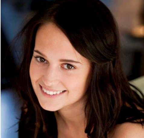
Alicia Vikander (courtesy of Marica Rosengård)

Another re-make is Easy Money by Daniél Espinosa, the Swedish film that managed to kick Avatar from the top spot at the box office in Sweden and ended up being by far the most watched domestic film in 2010 with an audience of more than 600,000 (in a country of 9 million inhabitants).