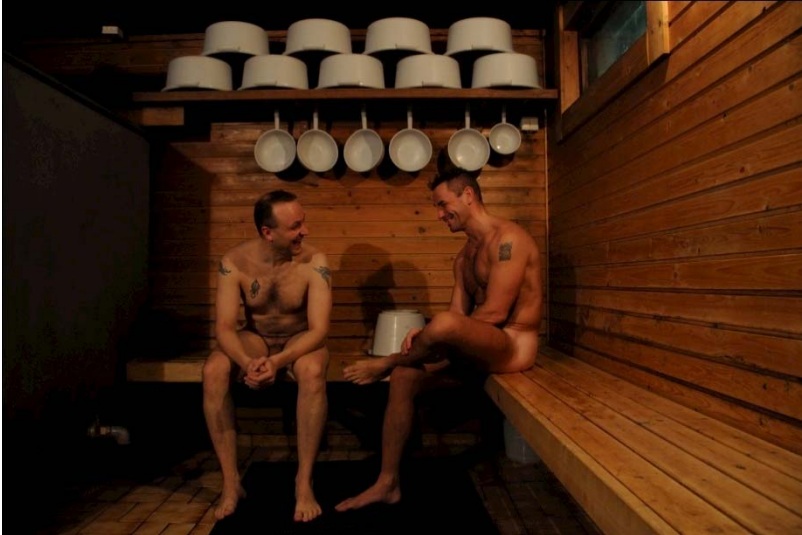
Steam of Life