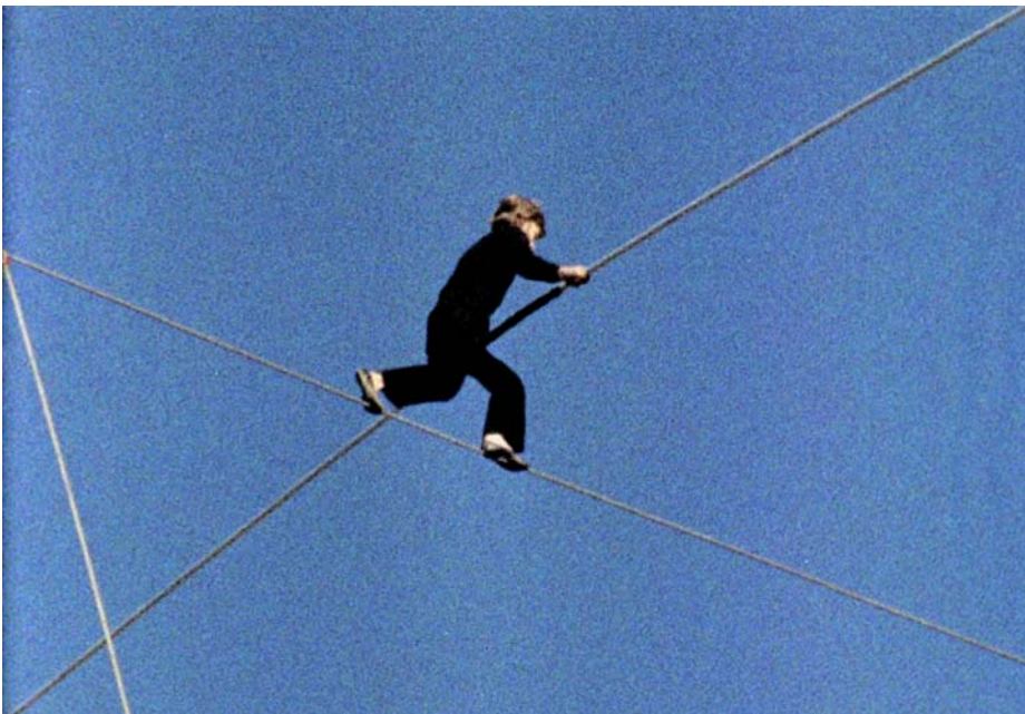
Man On Wire

This year's line-up of new films includes Terence Davies's The Deep Blue Sea , Lynne Ramsay's We Need to Talk About Kevin , Andrea Arnold's Wuthering Heights and Berlin Competition film, Ralph Fiennes's Coriolanus . New filmmakers continue to emerge such as Duncan Jones ( Moon ) and Gareth Edwards ( Monsters ), both of whom have made emotionally powerful science fiction films on modest budgets.