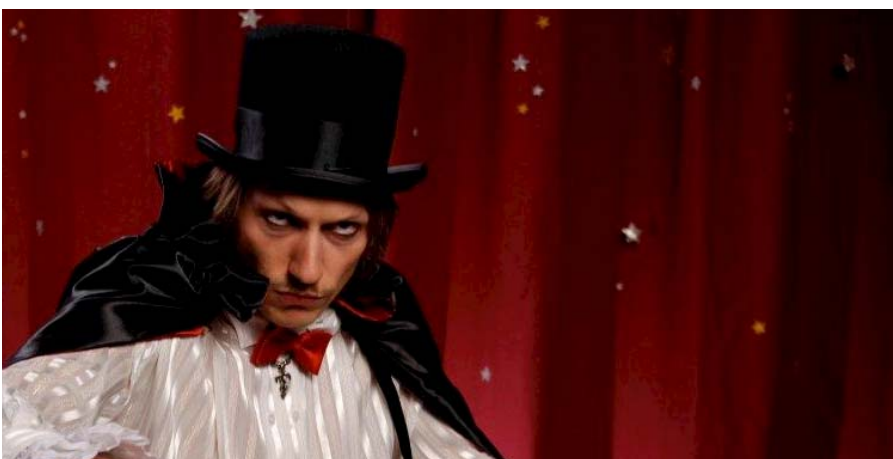
Instead of Abracadabra

Swedish actors are also sought after in Hollywood with the Millennium trilogy star Noomi Rapace (currently shooting the Sherlock Homes sequel), and actor Alexander Skarsgård ( True Blood , Generation Kill ) leading the way. Up-coming Berlinale shooting star Alicia Vikander is also rumoured to be cast in Snow White and the Huntsman .