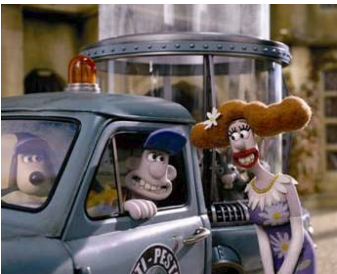
Wallace & Gromit in the Curse of the Were-Rabbit

Internationally, established actors, directors and writers such as Dame Judi Dench, Sean Connery, Ewan McGregor, Keira Knightley, Daniel Craig, Richard Curtis, Simon Beaufoy, Ridley Scott, Christopher Nolan, Paul Greengrass and Mike Newell continue to fly the flag for the UK film industry, often providing a canvas for filmmakers to bigger budget films, generally in partnership with Hollywood.