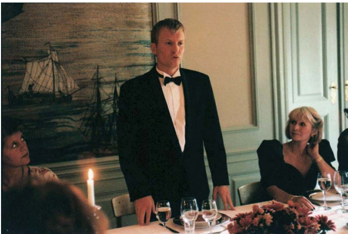
Thomas Vinterberg's Dogme film Festen (1998)