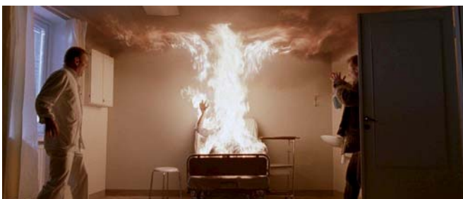
Let the Right One In

The aforementioned The Girl with the Dragon Tattoo is being re-made by director David Fincher and part of the film has been shot in Sweden.