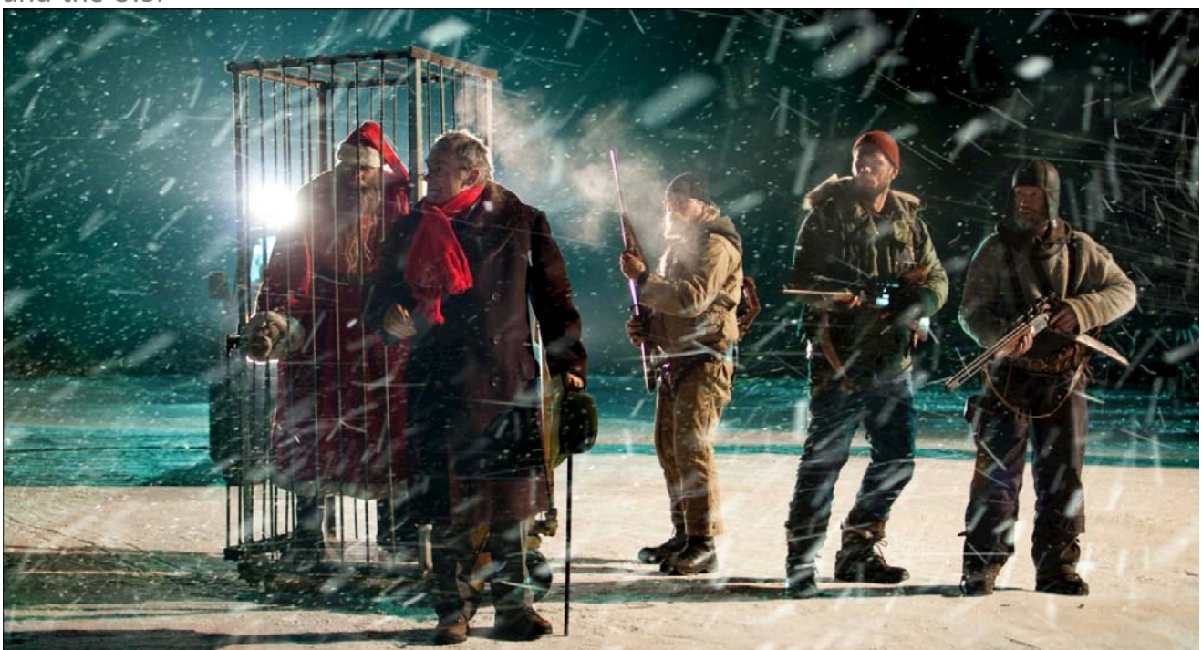
Rare Exports: A Christmas Tale

A new and fast-growing sector in Finnish film is the horror and fantasy genre. Jalmari Helander's Rare Exports: A Christmas Tale (2010) had its world premiere in Locarno and has won many international festival awards since then. This twisted and original take on Santa Claus has been internationally acclaimed and was released simultaneously in Finland, Great Britain, Australia and the U.S.