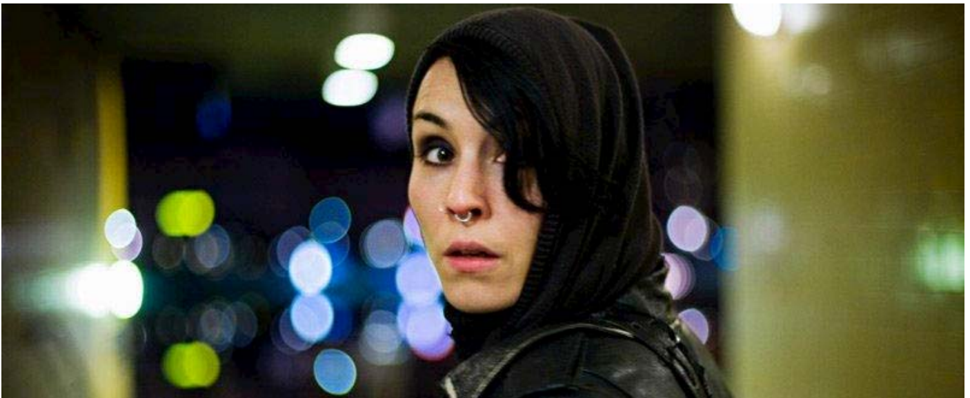
The Girl With The Dragon Tattoo - Noomi Rapace

During the last few years, we have seen the fortunes of Swedish films rise both domestically and internationally. Swedish films have been selected for all of the most prestigious film festivals, winning awards all over the world.