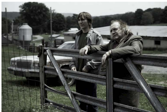
The Good Heart

Reimbursements are offered for film and TV production costs incurred in Iceland. Producers can apply for reimbursements from the State Treasury for 20% of the costs incurred in the production of films and television programmes in Iceland. Some of the films that have received such reimbursements are Flags of Our Fathers (2006), Hostel: Part II (2007), Stardust (2007) and Journey 3-D (2008)