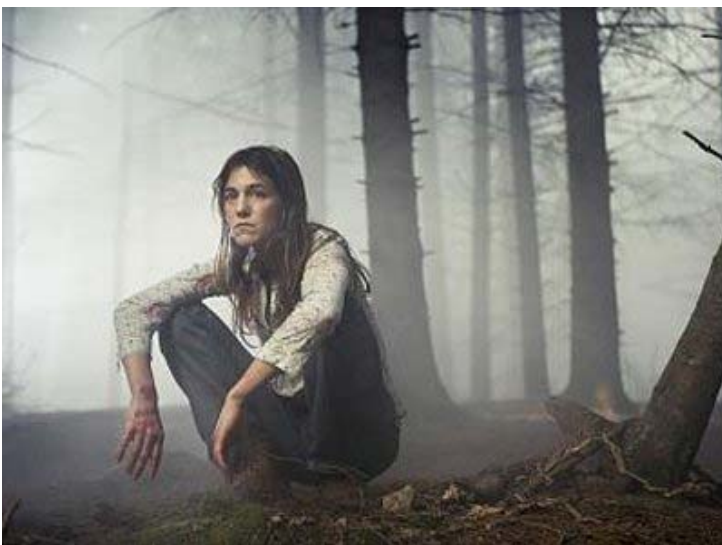
Charlotte Gainsbourg in Lars von Trier's Antichrist (2009)

Denmark has been producing films since 1896 and since the 1980s has maintained a steady stream of productions largely due to funding by the state-supported Danish Film Institute. Historically, Danish films have been noted for their realism, religious and moral themes, sexual frankness and technical innovation.