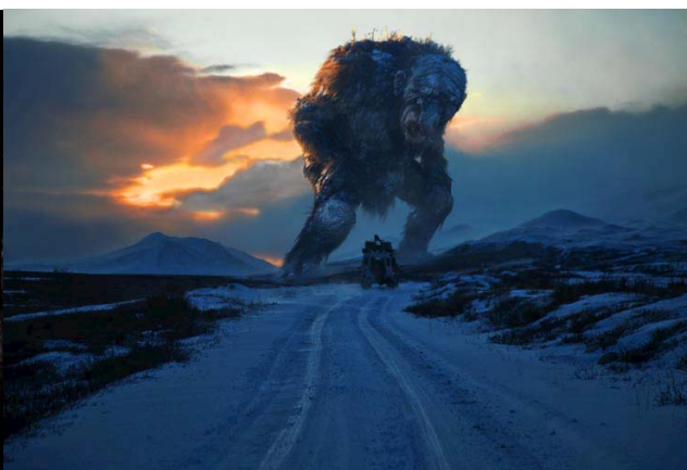
The Troll Hunter