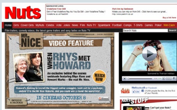
Featurette on www.nuts.co.uk