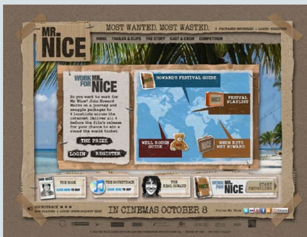
The game on the official Mr. Nice website (www.mrnice-themovie.co.uk)