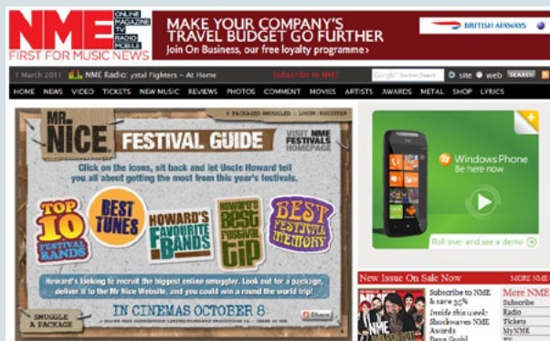
Featurette on www.nme.com

In the Mr. Nice campaign, a cookie was saved during the visit to the featurettes on partner websites. This cookie was then 'smuggled' back to the Mr. Nice website, which would check for the presence of this cookie.